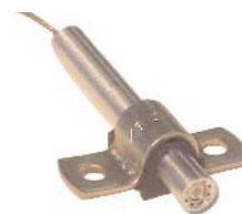
150065 APJ-1 Omega clamp metal clamp with rubber cushion for mounting 1.81" x 0.78" (45.97 x 19.81 mm)