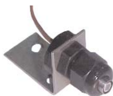
150062 & 836068 micro Thru-Fitting & MB-2 Mounting Bracket plastic fitting with lock nut, sealing nut, and hub 1.17" x 0.59" (29.7 x 14.99 mm) PG-7 thread