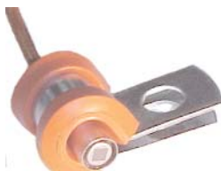
150037 MB-5 micro clamp mounting bracket Stainless Steel, with silicone cushions 0.25" diameter