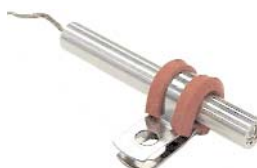
150038 MB-4 APJ-1 clamp mounting bracket Stainless Steel, with silicone cushions 0.38" diameter