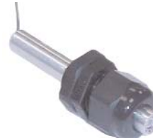
150063 APJ-1 Thru-Fitting plastic fitting with lock nut, sealing nut and hub 1.17" x 0.59" (29.7 x 14.99 mm) PG-7 thread