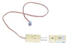
108000 IRt/c connector kit type K thermocouple connectors