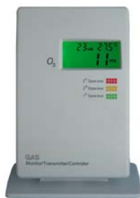
with desktop bracket