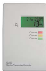
3-color backlit LCD