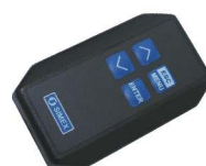
IR remote controller SIR-15