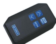
IR remote controller SIR-15