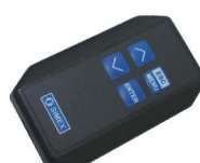
IR remote controller SIR-15