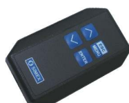
IR remote controller SIR-15